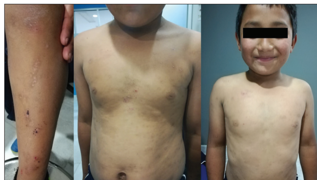
Figure 3 - Evolution of skin lesions.

The yearly cost analysis of the immunotherapy was $ 60.00 on average for each patient which was accompanied by a reduction in the conventional medicines (antihistaminics, steroids, insect repellents) used, compared to the control group receiving conventional treatment with an average cost of $ 180.00 for each patient without a decrease in the use of medications during the study period. After twelve months of treatment, all 12 patients who received immunotherapy, reported a decrease of persistent cutaneous lesions (papular urticaria) ( figure 3 ). On the contrary the other 8 patients with conventional treatment did not present a significant reduction of cutaneous lesions (papular urticaria).