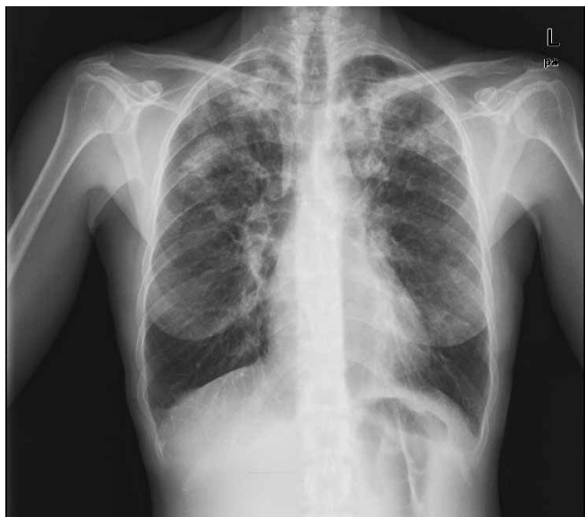
Figure 1 - Chest X-ray showed a parenchymal consolidation on the apex bilaterally and diffuse broncho-vascular markings of lungs.

in six months, the symptoms remained stable up to one week before admission, when fever (> 38°C) developed with worsening cough and dyspnea. On admission, the patient complained of productive cough. On physical examination, she had coarse