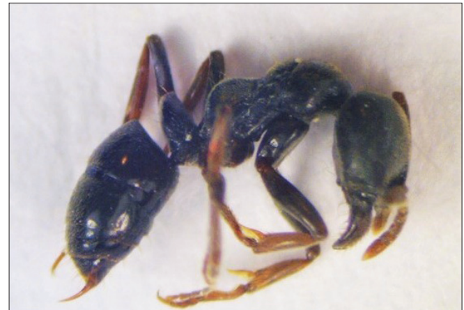
Figure 4 - Photograph of Pachycondyla sennaarensis (black Samsum ant).

the Middle East. Most cases of anaphylaxis to the PS sting lived in southern Iran.