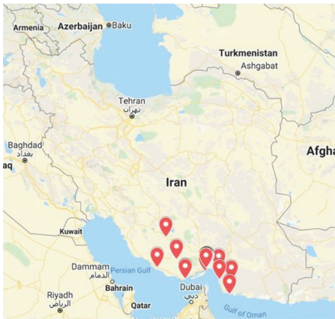
Figure 1 - The geographical locations of stings sites on the map.

Google Maps. Ant bite map. Available at: https://www.google.com/maps/@29.0938586,58.027778,6.49z .